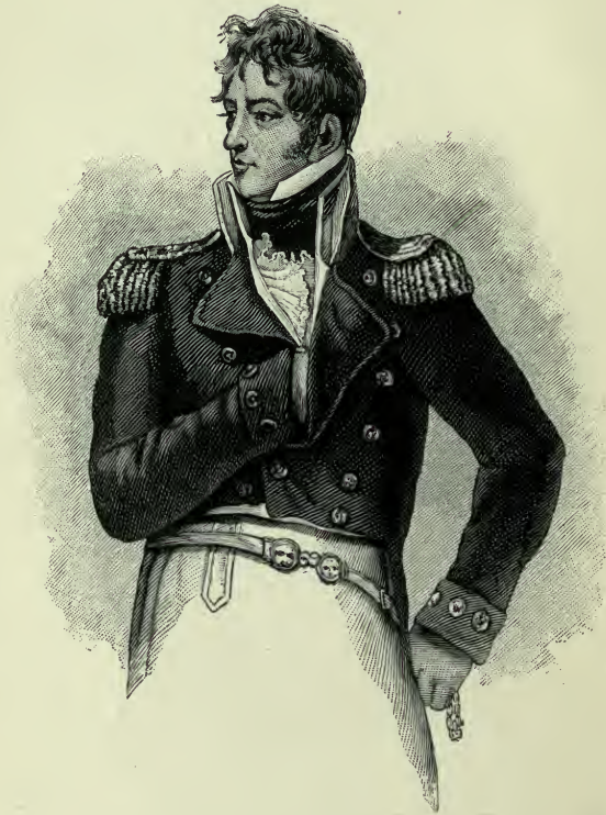
THE EARL OF DUNDONALD